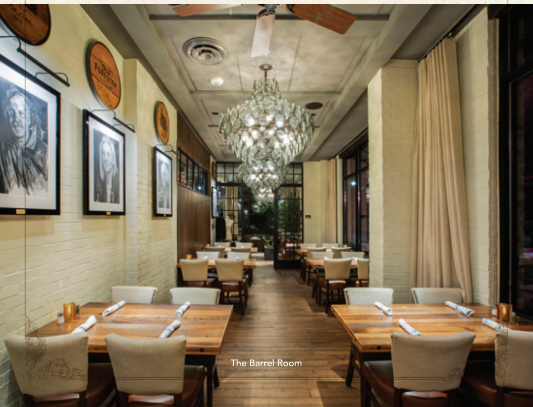
The Barrel Room

Contact our team at 614.695.6255 to start planning today.